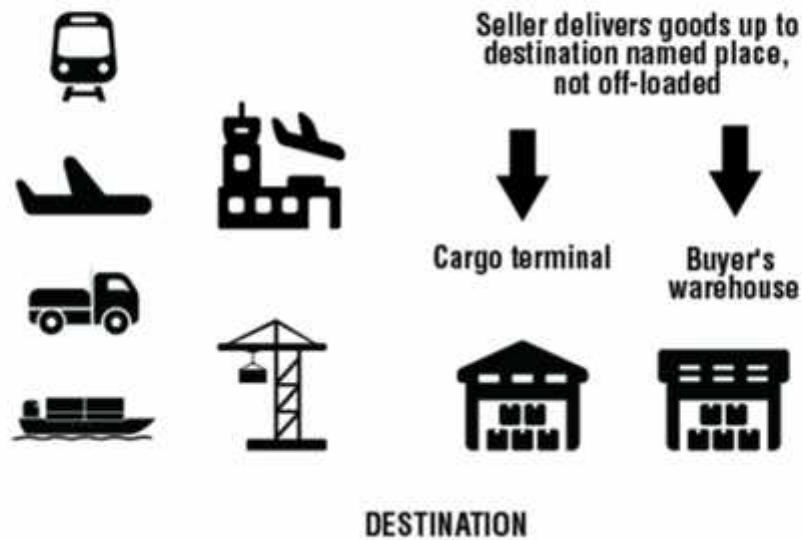
Diagram: DAP involves the seller delivering the goods up to the destination place, including transport from the terminal to the end place, at which point the liability of goods passes from seller to buyer.